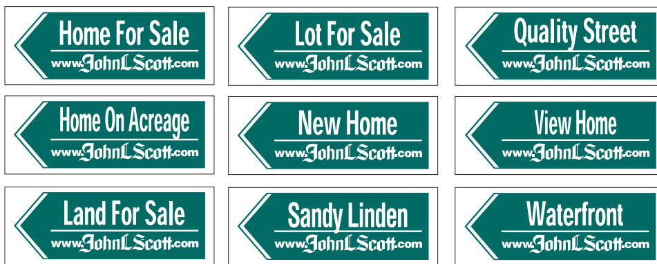
Item #3C822 9" x24" Personalized Arrow