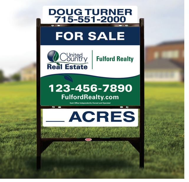
6 x 28 Riders sold separately - see page 6.