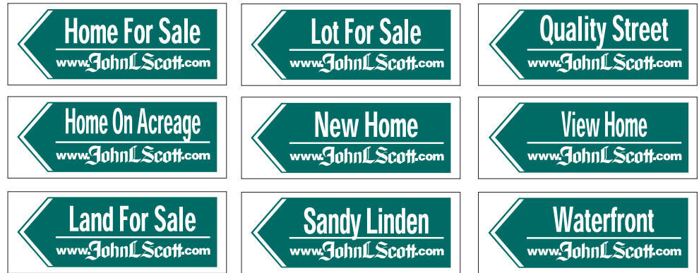
Item #3C822 9"x24" Personalized Arrow