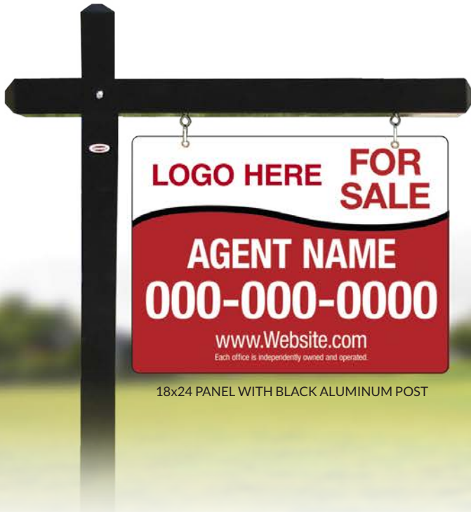
18x24 PANEL WITH BLACK ALUMINUM POST