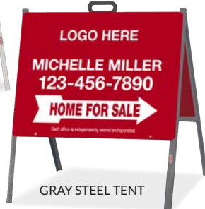
GRAY STEEL TENT