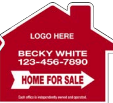
HOUSE SHAPE CORRUGATED PLASTIC