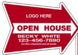
ARROW SHAPE CORRUGATED PLASTIC