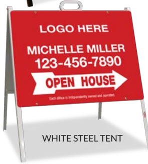
WHITE STEEL TENT