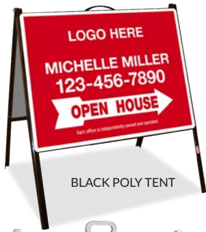
BLACK POLY TENT